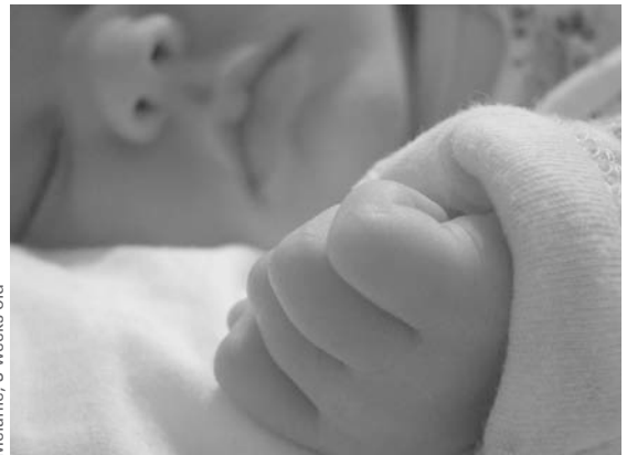
Melanie, 3 weeks old

If mother has high levels of oxytocin, endorphins and catecholamines at birth, baby is born with high levels of catecholamines too and is bright and alert. High levels of endorphins in your breast milk will help ease baby's transition in the first hours and days after birth. Skin to skin on your abdomen, baby's head and hand movements will stimulate your body to continue to produce oxytocin, the hormone that now takes on a new role, facilitating milk let-down as well as preventing excessive maternal bleeding. High levels of all of these—catecholamines, endorphins and oxytocin—contribute to the feelings of exhilaration, euphoria and joy that women describe holding their babies right after birth.